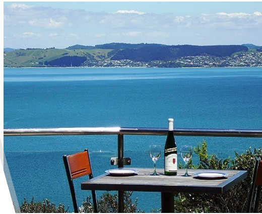
Relax on the balcony